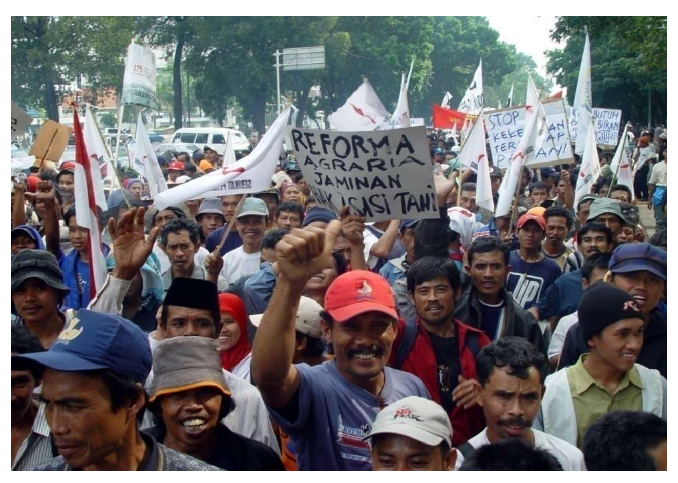
Land rights protest in Indonesia

The other shock was learn that, today, small farms have less than a quarter of the world's agricultural land – or less than a fifth if one excludes China and India from the calculation. Such farms are getting smaller all the time, and if this trend persists they might not be able to continue to feed the world.