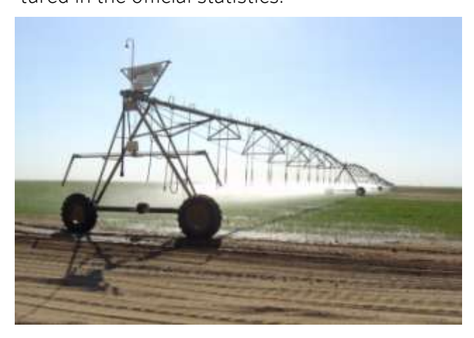
Centre-pivot irrigation, Algeria

And finally, also missing in our calculations is the recent wave of land grabbing that is now handing millions of hectares of fertile farmland to large corporations and depriving tens of thousands of farming communities of their livelihoods. Today's massive land grab took off only in the last decade and has yet to be captured in the official statistics.