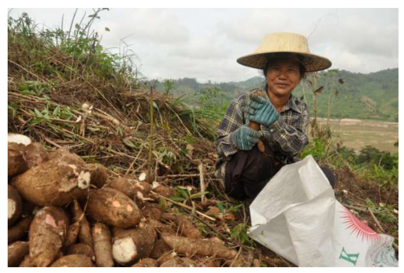
Growing cassava on the banks of the Mekong. Small farms tend to prioritise food production over commodity or export crop production.

Statistics about the role of women in Asia and Africa are difficult to obtain. According to FAOSTAT, only 30% of the rural population in Africa is economically active in agriculture and 40% in Asia -- around 45% being women and 55% men. 63 Yet studies carried out or cited by FAO show totally different numbers, indicating that in non-industrialised countries 60 to 80% of the food is produced by women.<sup>64</sup> In Ghana and Madagascar, women make up about 15% of farm holders, but provide 52% of the family labour force and constitute around 48% of paid workers. 65 In Cambodia, just 20% of agricultural land holders are women, but they provide 47% of the paid agricultural force and almost 70% of the labour force on family farms.<sup>66</sup> In the Republic of the Congo, women