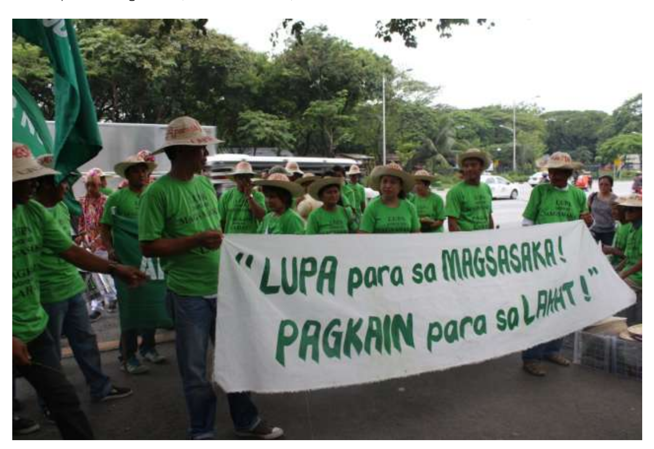
"Land for the Farmers! Food for Everyone!"

Doing nothing to turn this situation around will be disastrous for all of us. Small farmers -- the vast majority of farmers, who tend to be the most productive and who produce most of the world's food -- are losing the very basis of their livelihoods and existence: their land. If we do nothing, the world will lose its capacity to feed itself. The message, then, is clear. We urgently need to launch, on a scale never seen before, genuine agrarian reform programmes that get land back in the hands of small and peasant farmers.