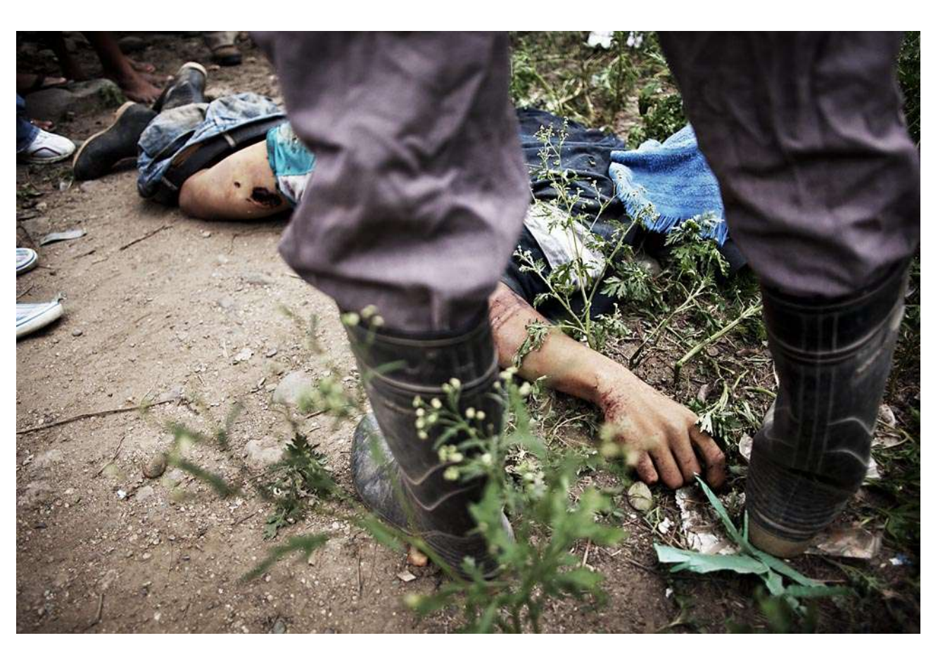
A killing of a campesino in Bajo Aguán, Honduras.

Rural people don't simply make a living off the land, after all. Their land and territories are the backbone of their identities, their cultural landscape and their source of well-being. Yet land is being taken away from them and