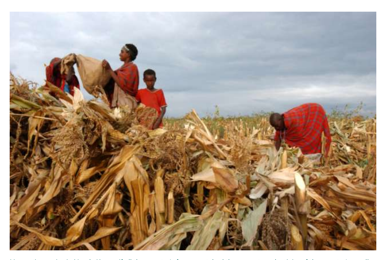
Harvesting maize in Narok, Kenya: if all the country's farms matched the current productivity of the country's small farms, Kenya's agricultural production would double.