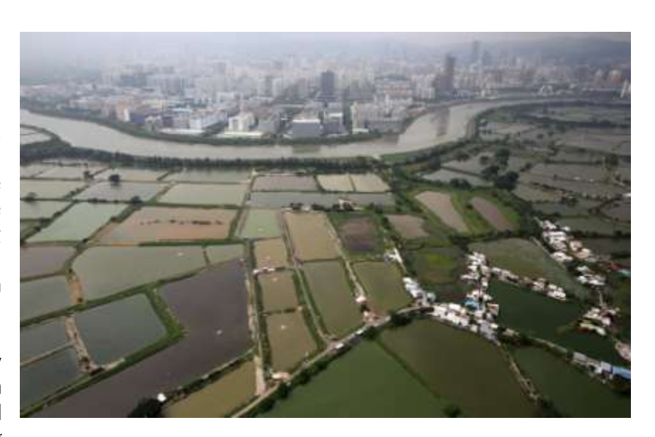
Shenzen versus farmland

all-encompassing definition was impossible because in many cases it would have rendered the available data inapplicable or impossible to interpret.