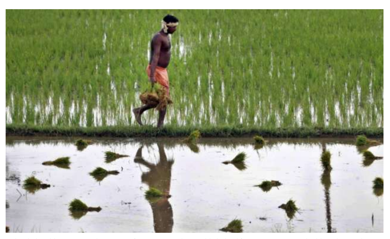
Flooded paddy in Orissa: the average farm size in India roughly halved from 1971 to 2006, doubling the number of farms measuring less than two hectares

Although big farms generally consume more resources, control the best lands, receive most of the irrigation water and infrastructure, get most of the financial credit and technical assistance, and are the ones for whom most modern inputs are designed, they have lower technical efficiency and therefore lower overall productivity. Much of this has to do with low levels of employment used on big farms in