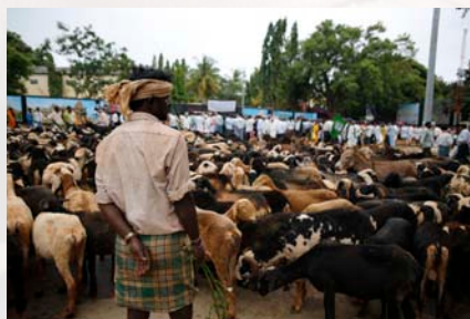
4,000 sheep join 1,000 people to protest the loss of kavals

rulings have been flouted to approve these projects. He called for immediate suspension of the officials responsible. According to the 73rd amendment of the Constitution, the gram sabhas (village assembly) should have approved the giving away of the kavals - however this was not done. Women of Dodda Ullarathi and Molakalmuru sang about the kavals . Unless immediate relief is provided the gathering agreed to boycott the upcoming Lok Sabha (general) elections and the government will be held responsible for the resulting chaos.