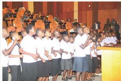
Children demanding attention to land issues from government officials

Children from Msasani Sunday School provided a stimulating interlude in the heated discussions with a song entitled an "Emergency Meeting." The song related how the children had called an emergency meeting to tell the leaders that there is growth in land grabbing in Tanzania and distrust. They demanded the government to be serious in land administration and implementation of land laws for sustainable peace.