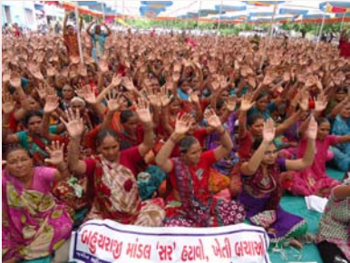
Mass protest has been key to raising the profile of local issues

While Azad Vlkas Sangathan spear-headed this agitation, another broader platform to advocate and agitate on the issue of land rights, the Jameen Adhikar Aandolan Gujarat (JAAG) was also formed, as a state level coalition. There is a general consensus that the resistance will be apolitical; political parties will not be given any space in public platforms.