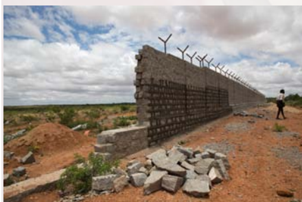
Walls block access to the kavals

The struggle to preserve the kavals in Chitradurga intensified in July 2013 with 1,000 people from 80 villages under taking a rally. In an unusual display of dissent, the pastoral communities brought along with them 4,000 sheep reiterating the heavy dependence on livestock rearing in this region.