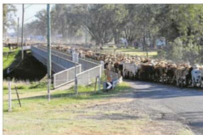
Part of the 18,000 heads of cattle making their way across Australia

government is responsible for ensuring the routes are open and serviced. Due to publicity of the movement, volunteer camp drafters and endurance riders are joining the mobs for a few weeks at a time. The complete journey could take up to six months. This event highlights the importance of mobility in livestock production across different continents.