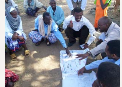
Communities must be at the forefront of land use planning

government level. Key components of this process were community engagement; patience; good communication and action-learning; strong negotiation; accurate data; and ensuring joint ownership and 'external' support.