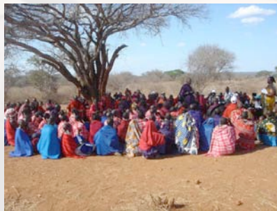
Securing consensus within and between men and women is key to good decision-making processes and change

addressing domestic violence, girls' education and land rights. Representatives from each women's rights committee are nominated to attend the district women's leadership forum, which represents and advocates for women's rights and interests at the district level, including meeting with the men's customary leadership forum.