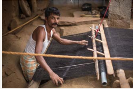
Livelihoods depend on livestock

In June 10,000 men and women attended a rally, in Gandhinagar. Despite the local government trying to scupper the protest, 500 tractors, 50-60 motorcycles, 10 mini-trucks and 50 four-wheelers took part. Along the entire rally route one could hear slogans like "Tell SIR, no Sir", "Remove SIR, save agriculture", "The village land belongs to the village, not to the government" and "We will give up our lives, not our land".