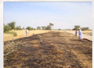
Burning and weeding a fire line

The local Pasture and Rangeland Administration should maintain pastures, fire lines (vital for preventing the spread of wildfire which destroy pasture and gum arabic trees), and migration routes but due to lack of budget, activities have been limited in recent years.