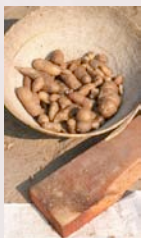
The harvesting of Devil’s Claw is highly lucrative for local communities

This enabled the development of a mutually beneficial relationship between the BNP and the KA. Since 2006, the MET has awarded the KA highly valuable hunting concessions earning about USD 214,000 per annum. Since 2008, the MET has also provided KA with a permit to harvest the medicinal plant Devil’s Claw ( Harpagophytum Zeyheri ), earning 562 harvesters USD 142,824 from the 2012 harvesting season alone. Between 2005 and October 2013, the KA earned over USD 1,180,000 from these two activities.