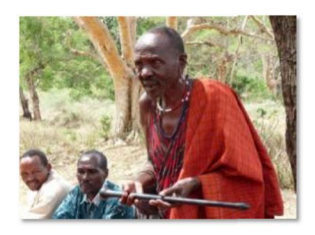
Oath taking was one of the strategies to end conflict and create peace

strategy for intervention - one that had not yet been tested – which was to form a joint council of elders for conflict resolution. This would help solve and de-escalate smaller conflicts over land that continued to break out, and that tended to escalate into heightened protracted violent conflict. It was agreed that in order to resolve any arising boundary or other localized conflict, two representatives from each village in the larger area - whether Batemi or Loita - would to mediate and chosen make recommendations for its resolution. No representatives would be drawn from the villages involved in the dispute. The appointed conflict mediators would then be much freer to act fairly in their resolution of the conflict.