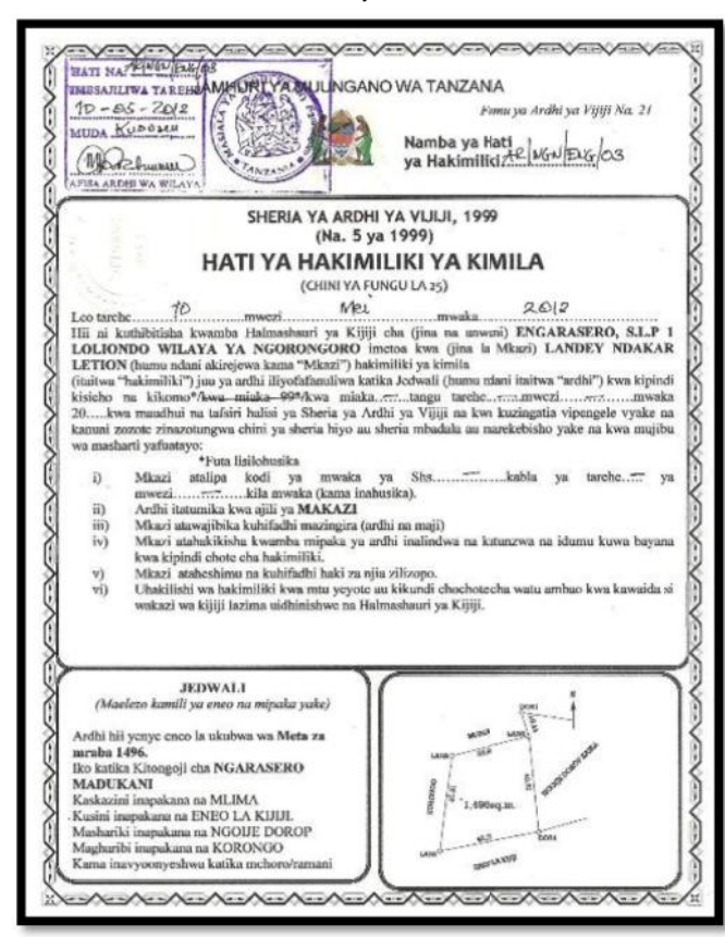
A community Customary Right of Occupancy Certificate

by The Nature Conservancy, UCRT started building the capacity of the community, as well as the other surrounding farming and pastoralist communities in the area. Trainings were held on good governance and also on the relevant policies and laws of local government, land and wildlife. UCRT also facilitated the villages to obtain village land certificates, which included their developing simple sketch maps on how people used their lands for hunter-gathering, grazing, farming and settlements. After the initial land use planning was carried out a more formal plan was produced and village by-laws to compliment these were written and passed.