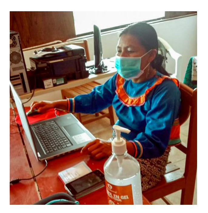
A woman from the Shipibo-Conibo indigenous people receives face-to-face training in Ucayali.

For each conference, rehearsals took place to manage technical limitations and to reinforce the women's experience in these spaces. They learned some moderation techniques and worked out the programme and questions. The sessions were successful in moderation, time management, participation, and responses to technical difficulties.