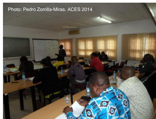
ACES 2014 Picture 4. Session of inception workshop 12th August 2014

The impact team will subsequently work in the production of a policy note to inform on the current understanding of the land use change issue in Mozambique, highlighting agreements and discrepancies between groups and scales.