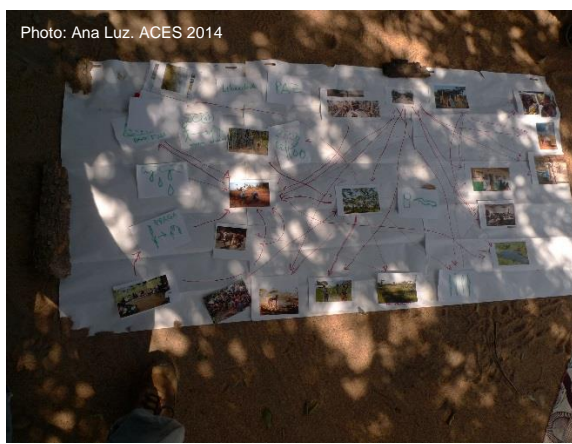
ACES 2014