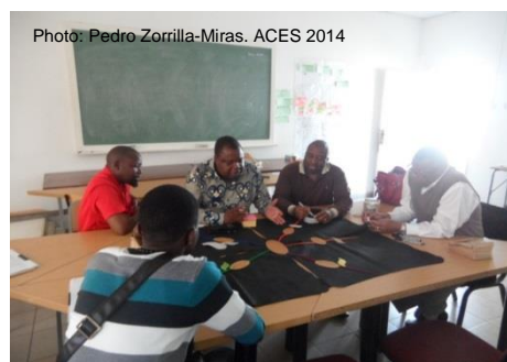
ACES 2014 WP5: As planned, during 2014 the WP5 was working on creating conditional probability tables. In addition, with the input from stakeholders storylines were created through the BBNs and scenarios workshop at both national and provincial level. WP5 is now working to create land cover and land use maps that, together with BBNs and scenarios, will contribute to the construction of land use models.

WP4: Its activities consist of the analysis of the data collected to link woodland health and wellbeing (WP2), the role of commercial agriculture (WP3) and future scenarios (WP5). The team responsible for WP4 participated in the pilot phase of field work that contributed to the methodologies of data collection. As soon as the data from the WP2, 3 and 5 are available, the WP4 team will start its analysis, using structural equation modelling to identify the linkages between ecosystem services structure and wellbeing.