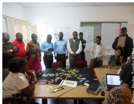
Picture 7. Participatory process of scenario design