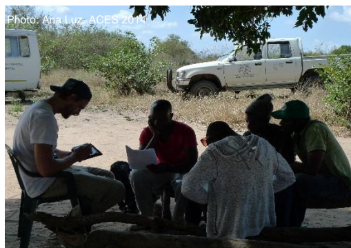
Picture 6. Students being trained in the use of tablets for data collections.