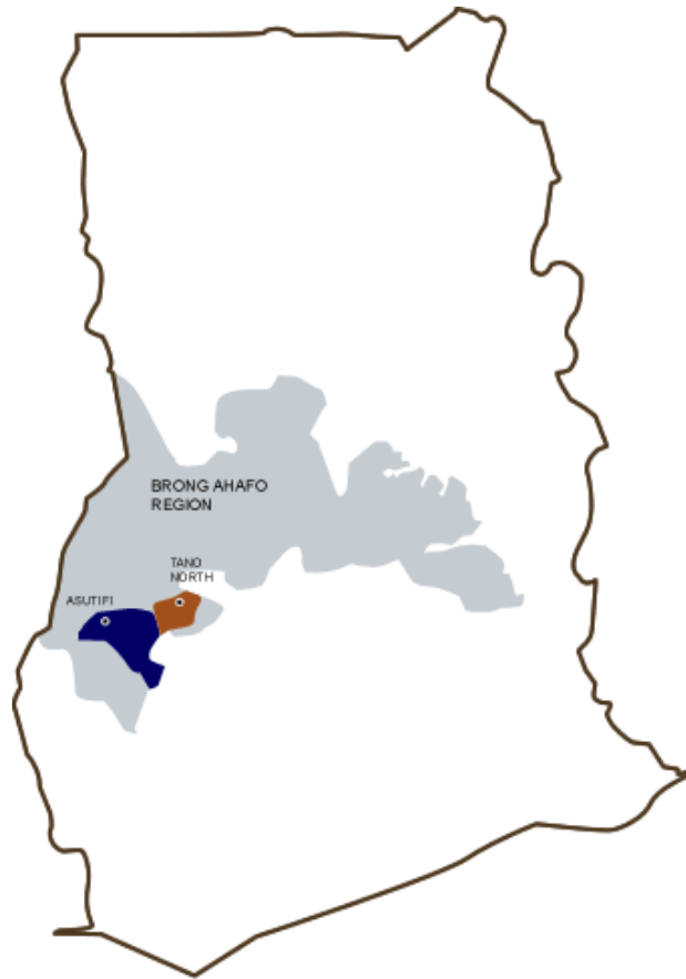
Figure 2-1 Map of Brong Ahafo Region Featuring Asutifi and Tano North Districts 54

The ten identified “host communities,” identified by NGGL because they overlap with the mining lease, are located in two districts inside the region: Asutifi North and Tano North (see Figure 2-1). The Ahafo South concession, within the Asutifi North district, contains the host communities of Ntotroso, Kenyasi No. 1, Kenyasi No. 2, Gyedu, and Wamahinso (see Figure 2-2). The host communities of Susuanso, Terchire, Yamfo, Afrisipakrom, and Adrobaa, are located in the Tano North district, within the Ahafo North concession (see Figure 2-2). 55 To date, NGGL has only carried out mining within the southern concession area; the northern communities have only experienced exploration activities. While there is no formally disclosed date for when the development of the Ahafo North mine will occur, in its first quarter 2018 results, Newmont noted that Ahafo North has advanced to a definitive feasibility study. 56