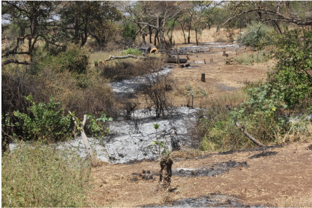
Above: Uncontrolled tree cutting & burning to clear land for cultivation along the banks of Nakiloro River in Kakingol, Moroto District

Due to loss of vegetation cover, soil erosion has become a big challenge especially along the river banks largely because of poor cultivation practices and overgrazing around kraals and watering points. Soil erosion was quite eminent in some sampled patches of the rangelands, as evidenced by gulleys that traversed the landscape. The main effect of soil erosion is degradation of the rangelands specifically by emergence of bare land, poor pastures and low crop yields. Field observations and estimates indicated that, in the Mountain landscape ( Emoru ), 10% of the land was bare in both Moroto and Napak; particularly in the areas of Musupo, Loputuk and Namnam. In Napak, the bare ground was mainly around watering points and in the areas of Nakichumet.