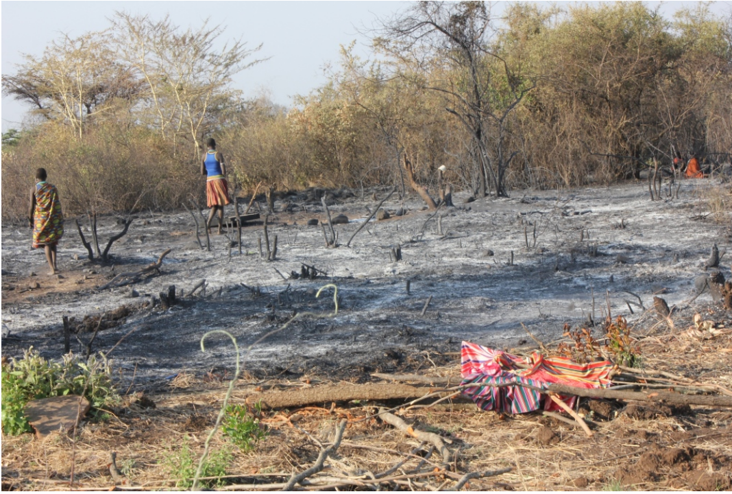
Above: Slash and burn agriculture in Loputuk

Weak natural resources management institutions and structures were identified as another contributing factor to rangeland degradation in the region. Degradation continues to take place in the presence of technical staff and both politically elected and customary institutional arrangements. This is partly associated with insufficient political will and support to enforce existing environmental policies and laws; and the weakening of the traditional institution – the Akiriket .