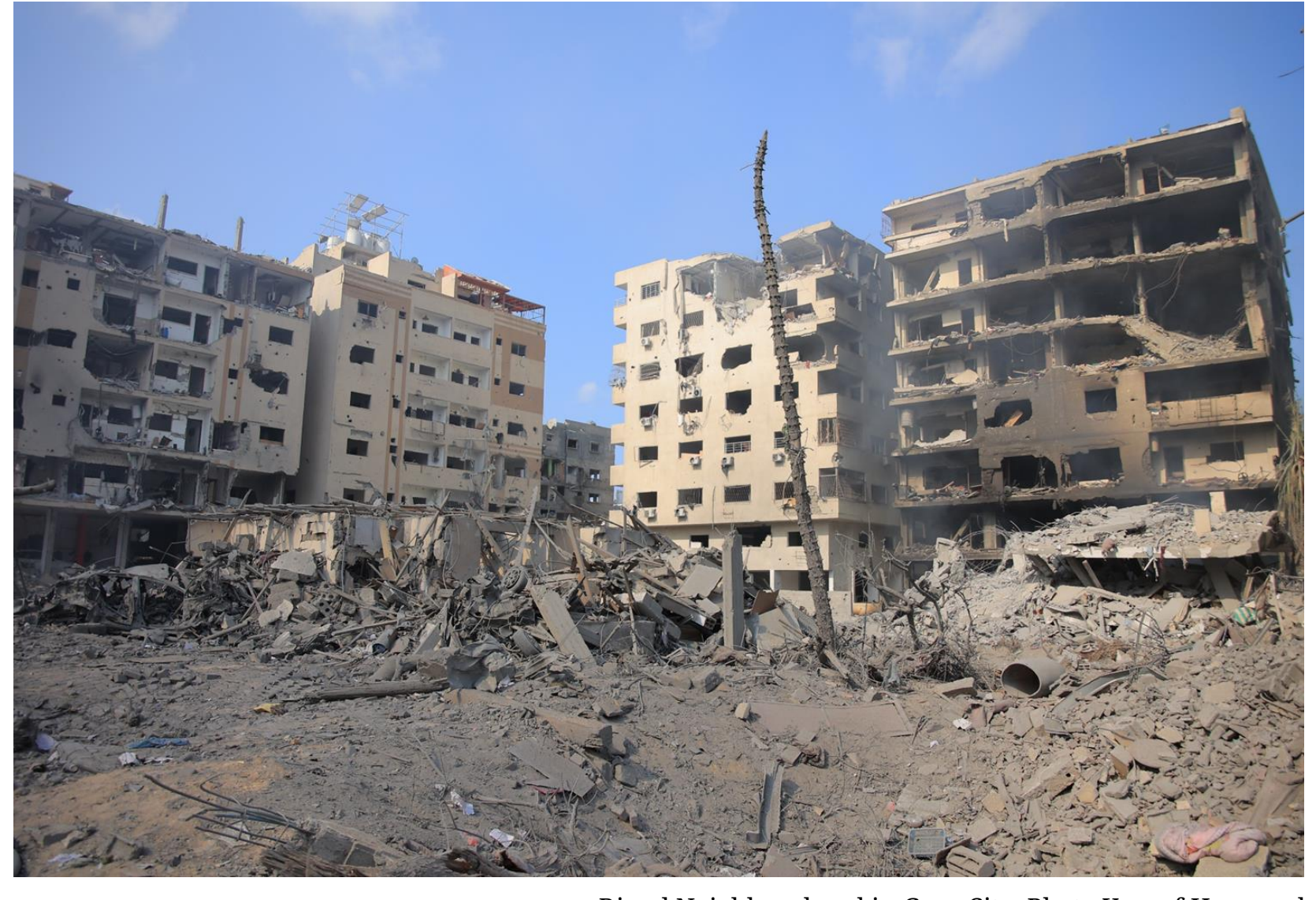
Rimal Neighbourhood in Gaza City.